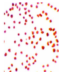
Immunohistochemical analysis of formalin...