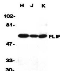
Western blot analysis of HeLa (H), Jurka...