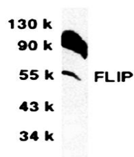
Western blot analysis of NIH/3T3 whole c...