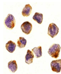
Immunohistochemical analysis of formalin-fixed tissue sections.