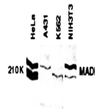
Western blot analysis of indicated whole...