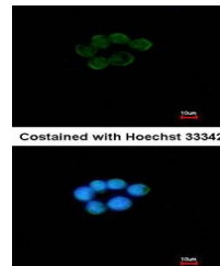
Confocal immunofluorescence analysis of ...