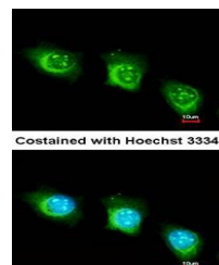
Confocal immunofluorescence analysis of ...