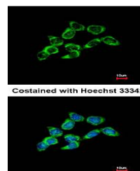
Confocal immunofluorescence analysis of ...