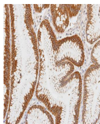
Immunohistochemical analysis of formalin...