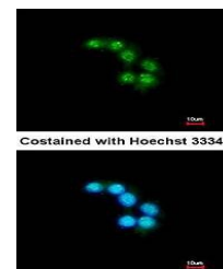
Confocal immunofluorescence analysis of ...