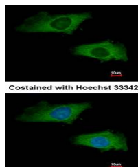
Confocal immunofluorescence analysis of ...