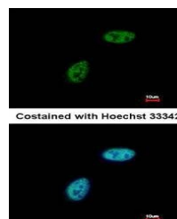
Costained with Hoechst 33342