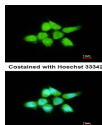
Confocal immunofluorescence analysis of ...