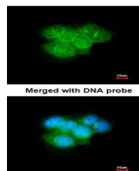
Confocal immunofluorescence analysis of ...