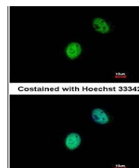
Confocal immunofluorescence analysis of ...