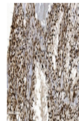
IHC analysis of Ku70 using anti-Ku70 antibody.