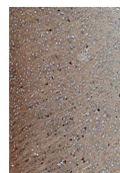
IHC analysis of SV2A using anti-SV2A antibody.