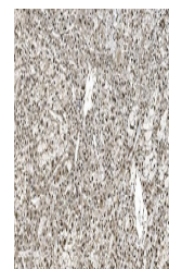
IHC analysis of HNRNPH3 using anti-HNRNP...