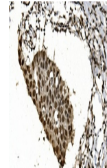
IHC analysis of HNRNPH3 using anti-HNRNP...