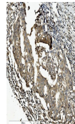
IHC analysis of Caspase-7/CASP7 using an...