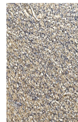
IHC analysis of ATG9A using anti-ATG9A a...