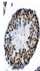
IHC analysis of PTBP2 using anti-PTBP2 antibody.