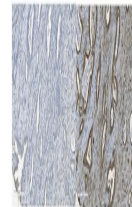
IHC analysis of MCM5 using anti-MCM5 ant...