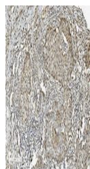
IHC analysis of MCM5 using anti-MCM5 ant...