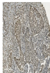
IHC analysis of U2AF65/U2AF2 using anti ...