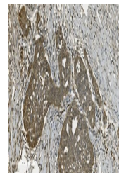
IHC analysis of U2AF65/U2AF2 using anti ...