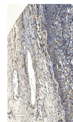
IHC analysis of Collagen VII/COL7A1 usin...