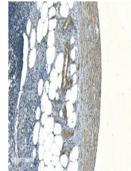
IHC analysis of H Cadherin/CDH13 using a...