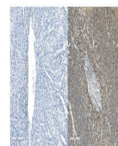
IHC analysis of OB Cadherin/CDH11 using the antibody.