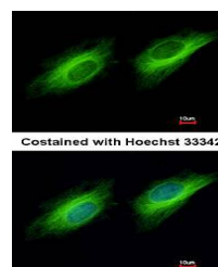
Confocal immunofluorescence analysis of ...