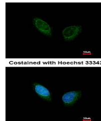
Confocal immunofluorescence analysis of ...