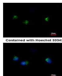
Confocal immunofluorescence analysis of ...