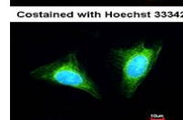
Confocal immunofluorescence analysis of ...