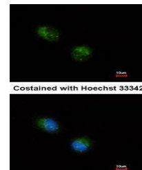
Confocal immunofluorescence analysis of ...