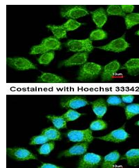
Confocal immunofluorescence analysis of ...