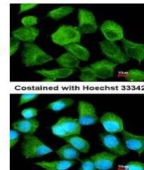
Immunofluorescence analysis of SW480 xen...