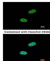
Confocal immunofluorescence analysis of ...