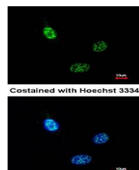
Confocal immunofluorescence analysis of ...