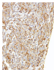
Immunohistochemical analysis of formalin...