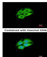
Confocal immunofluorescence analysis of ...