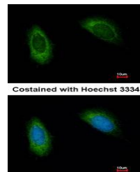
Confocal immunofluorescence analysis of ...