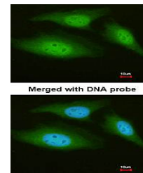
Confocal immunofluorescence analysis of ...