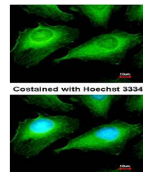
Confocal immunofluorescence analysis of ...