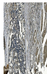
IHC analysis of GNG7 using anti-GNG7 ant...