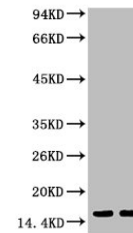
Western blot analysis of HeLa using Tri-...