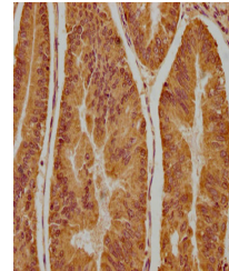
Immunohistochemical staining of human en...