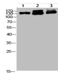
Western blot analysis of 823 293T-UV HEL...