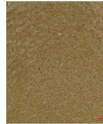
Immunohistochemical staining of Mouse Brain