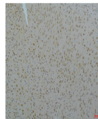
Immunohistochemical staining of Mouse Brain