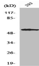
Western blot analysis of 293 cells using...