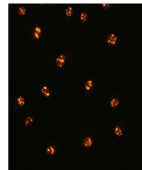
Immunofluorescent analysis of STK4 stain...