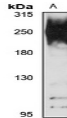
Western blot analysis of NUP210 expression...